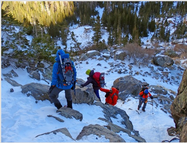
Sky Pond