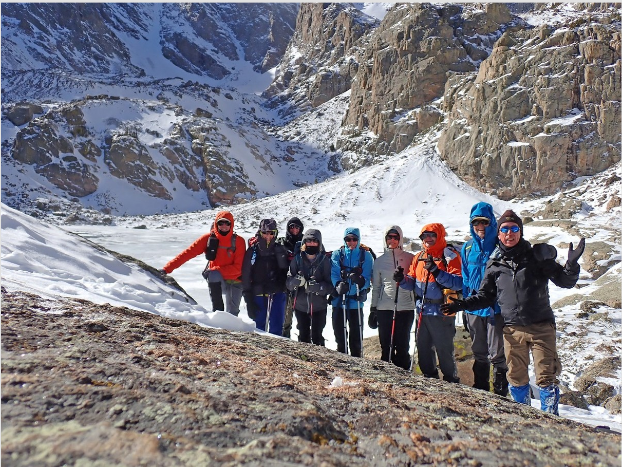
Sky Pond RMNP led and pic by Jim Guerra