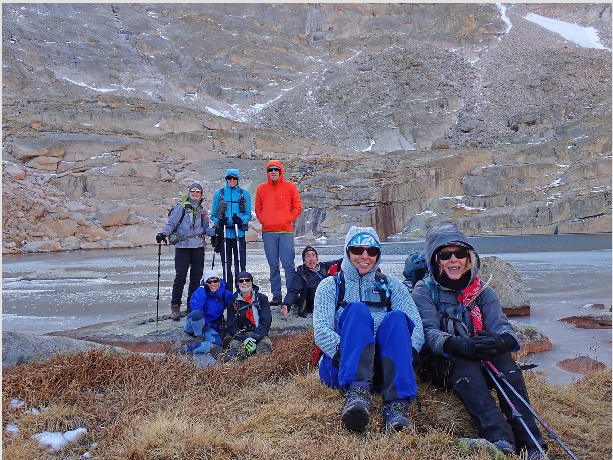
Glacier Gorge RMNP 4 lakes led and pic by Jim Guerra