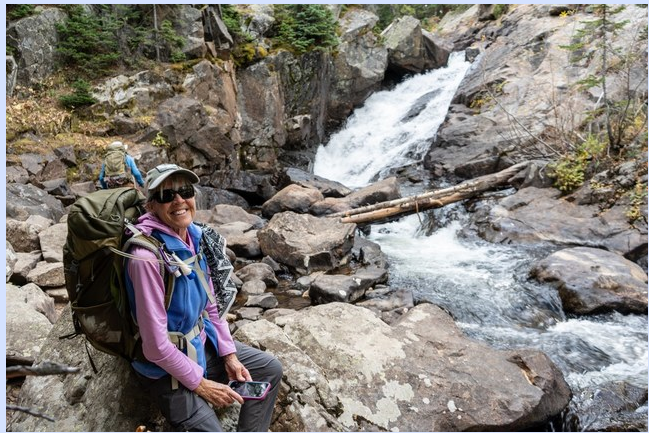
High Lonesome loop hike