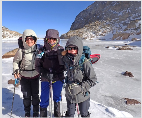
Lake of Glass