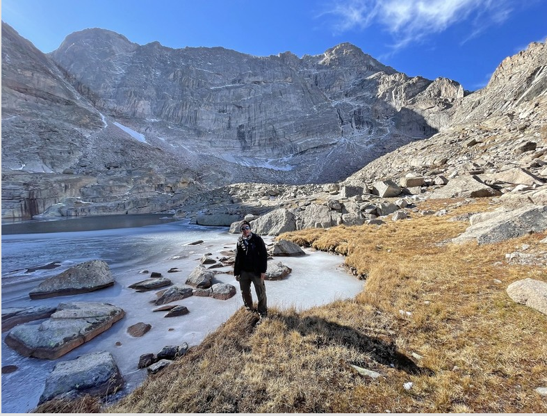
4 lakes RMNP Glacier Gorge led and pic by Jim Guerra