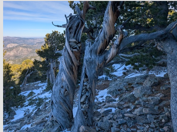
Twin Sisters