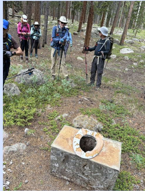
Things found in the woods