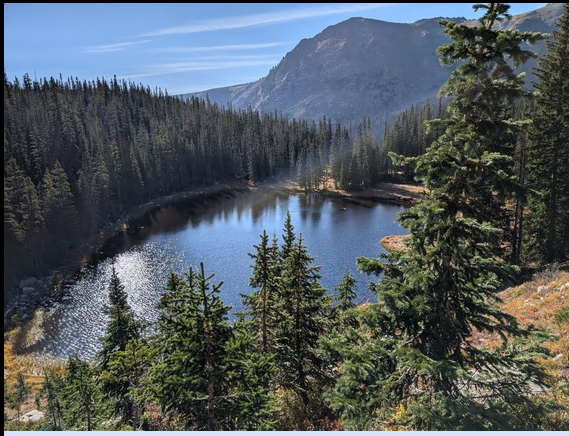
High Lonesome loop hike