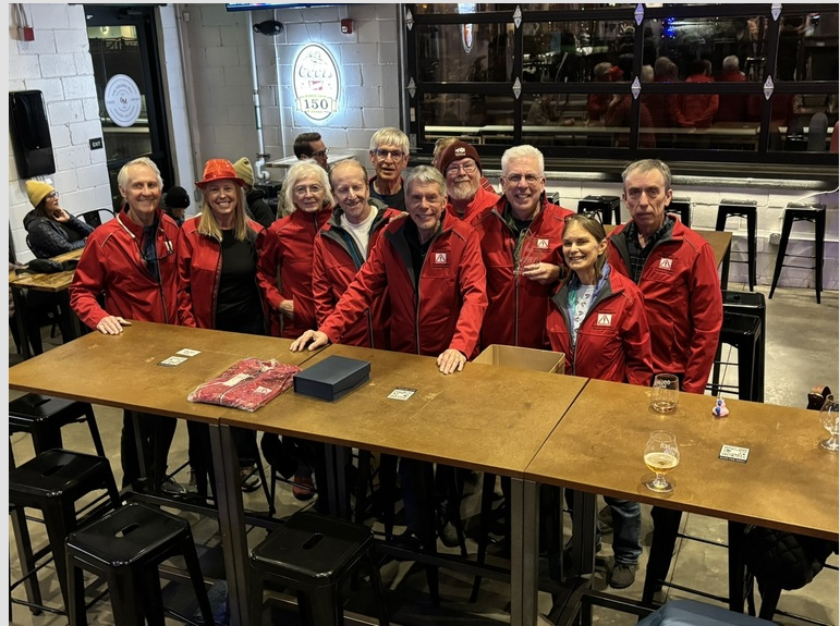
End of Year Celebration BIM instructors