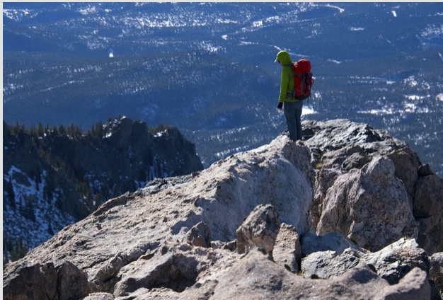
Twin Sisters