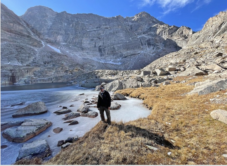
4 lakes RMNP Glacier Gorge led and pic by Jim Guerra