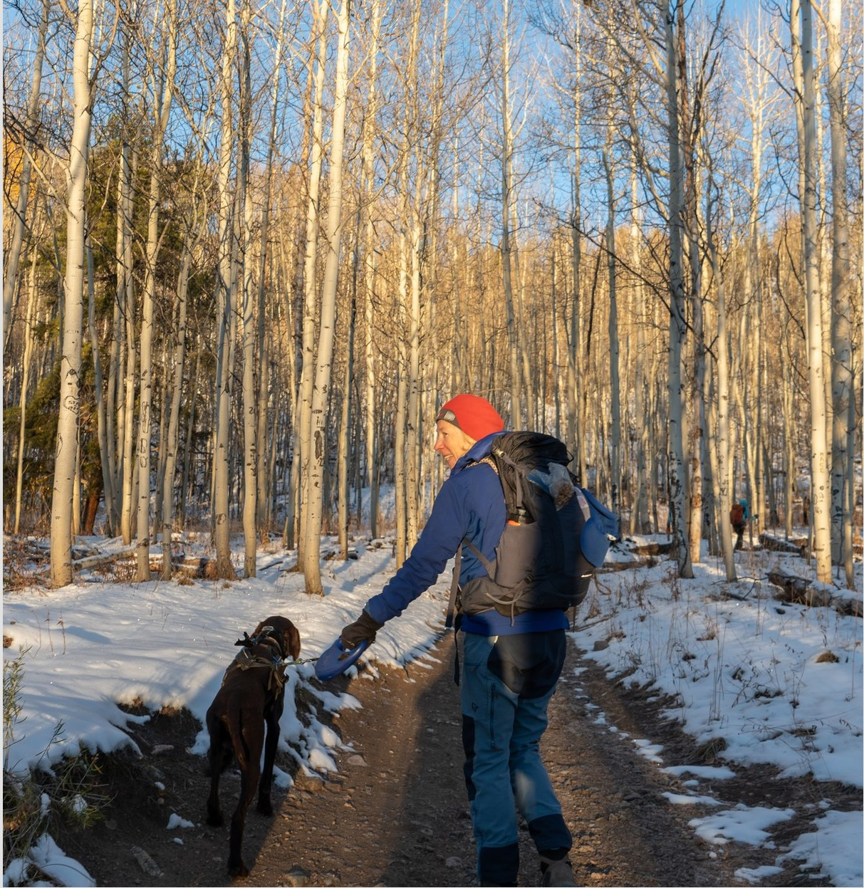
Eccles Pass hike