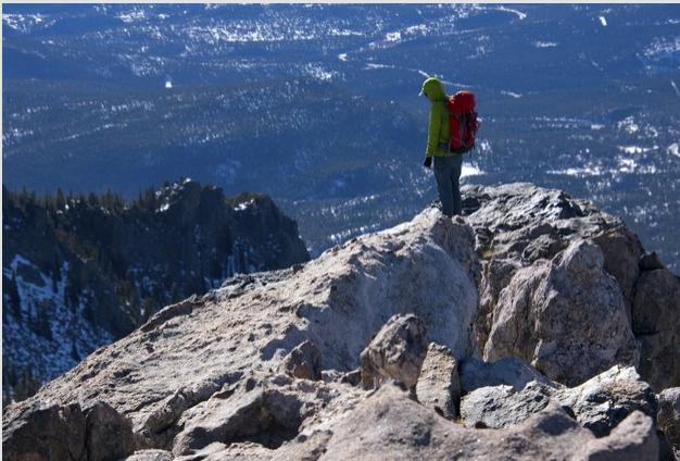
Twin Sisters