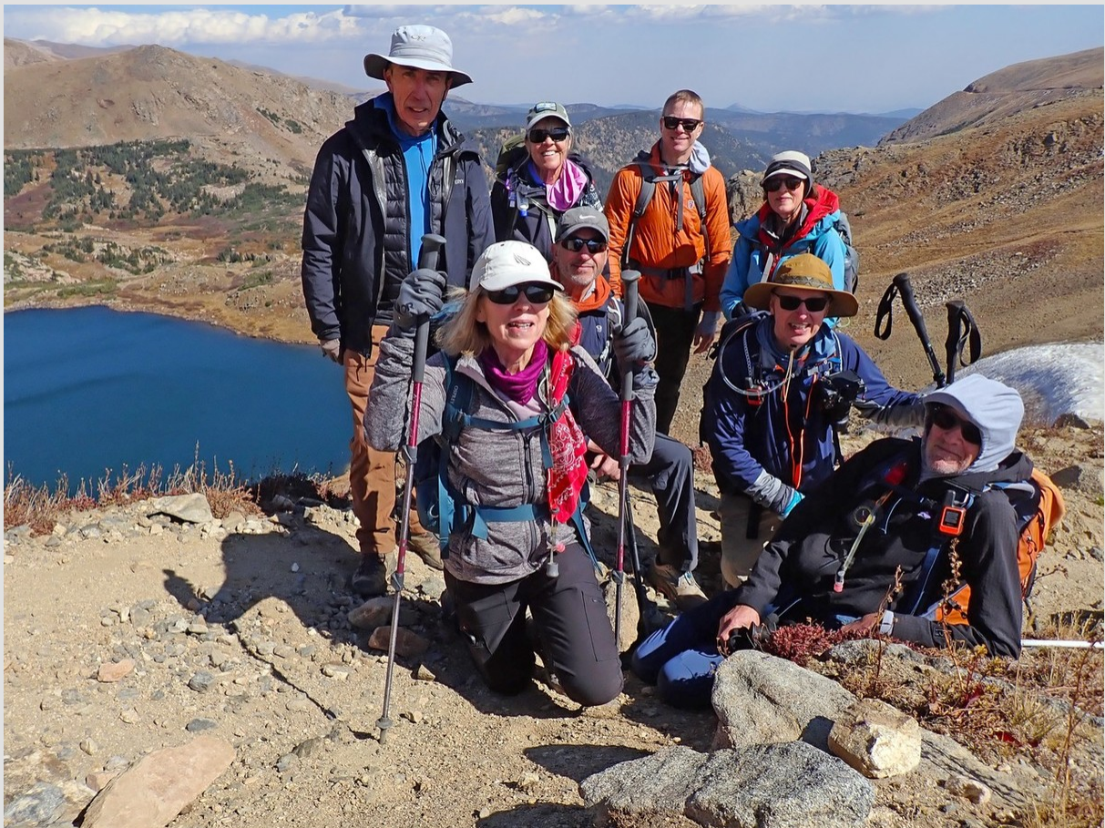
High Lonesome Loop from Hessie Trail led and pic by Jim Guerra