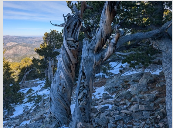
Twin Sisters