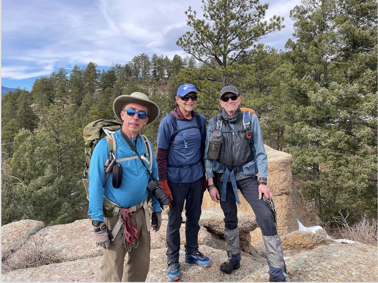
The Noddles