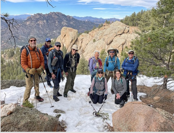
Noddles led and pic by Jim Guerra