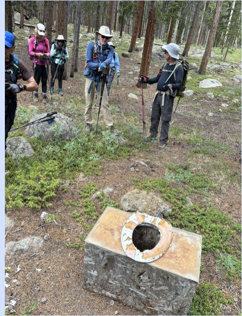
Things found in the woods