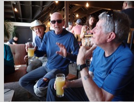
Outer Range Brewery Frisco