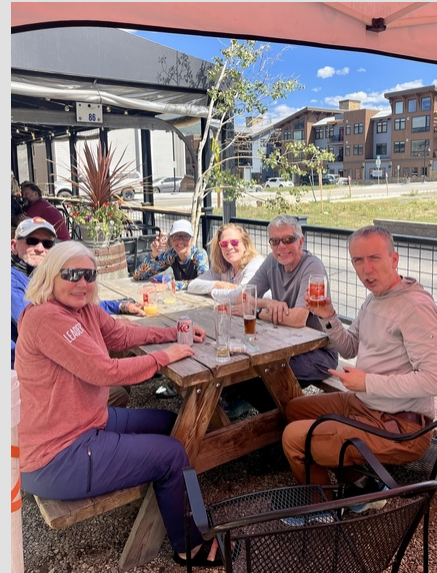
After Uneva Pk, Angry Jims Silverthorne