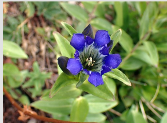
Hells Hole led and