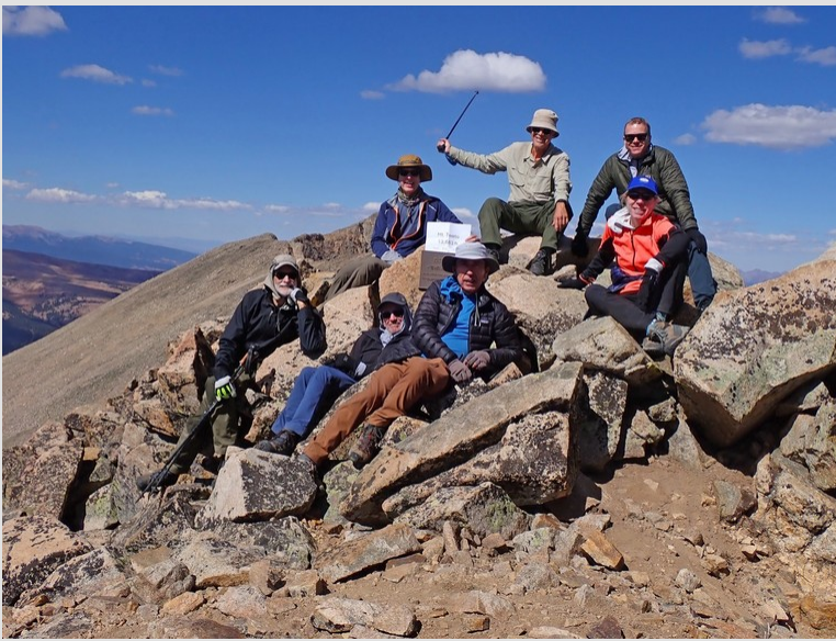
Mosquito Pk loop led and pic by Jim Guerra