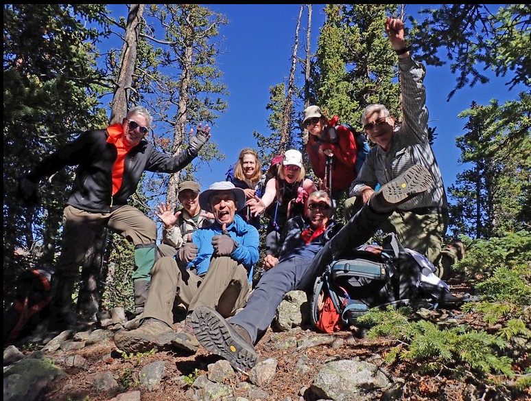
Arrowhead Pk led by and