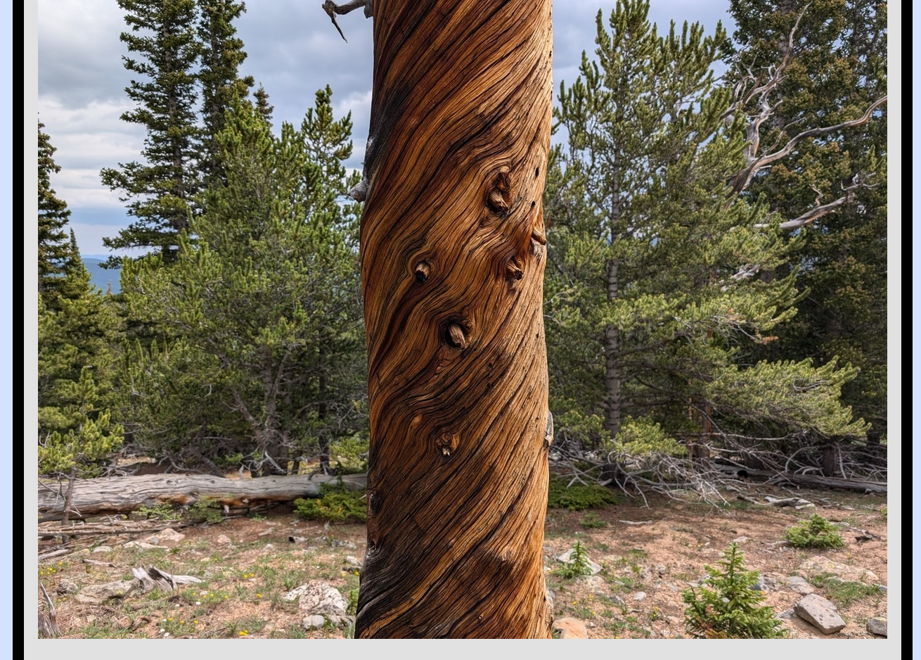
Fellow hikers have you seen a tree above like this, and do you know what causes the swirling bark?

Answer to be revealed in the next newsletter.