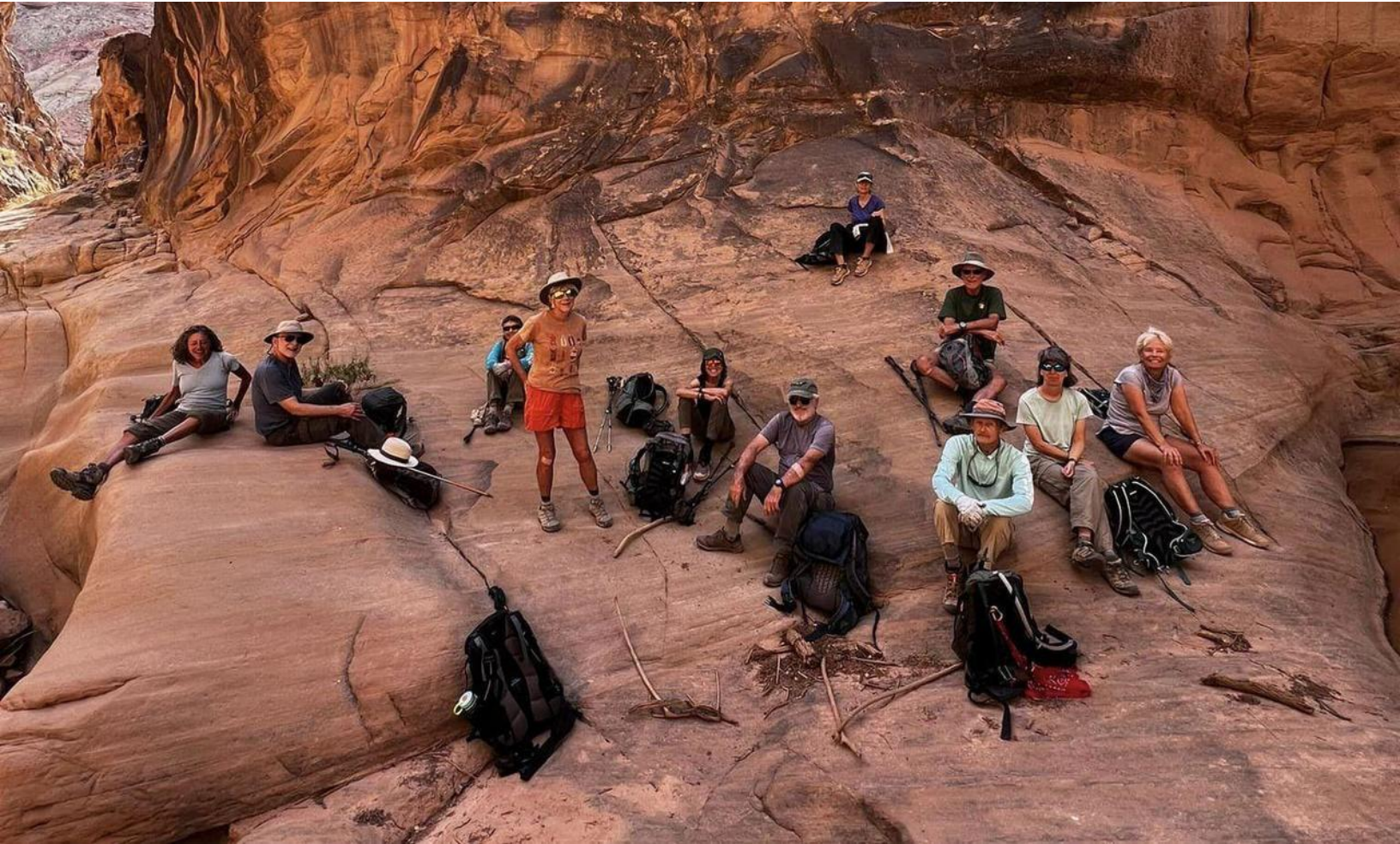
CMC members enjoying a hike to Eardley Pool on the Green River WSG trip. See below on how to submit your favorite photo for the newsletter!