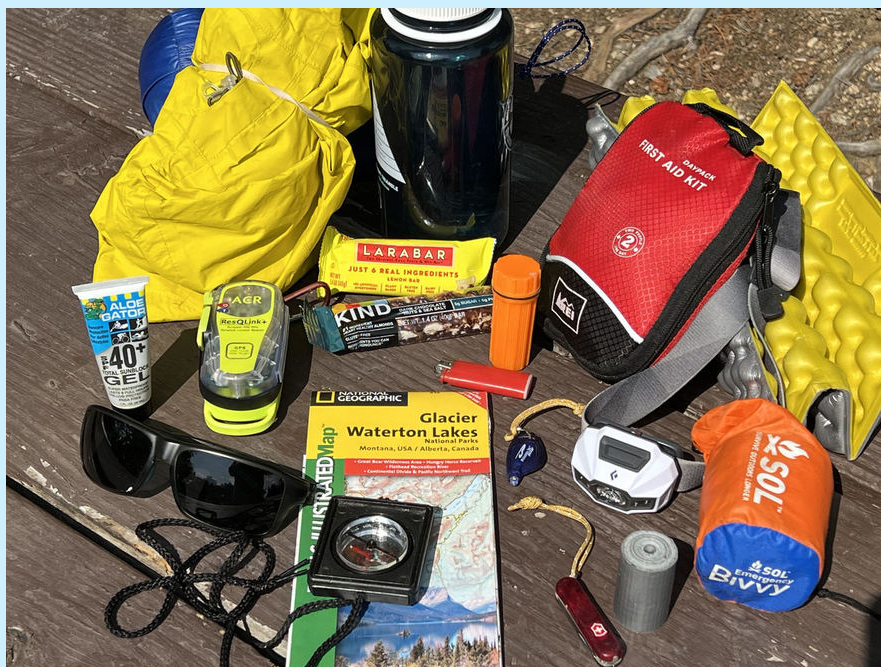
The ten essentials.