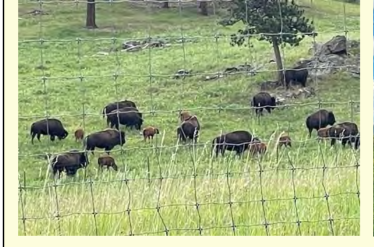
Bison calves and cows seen at Genessee Mountain Park.