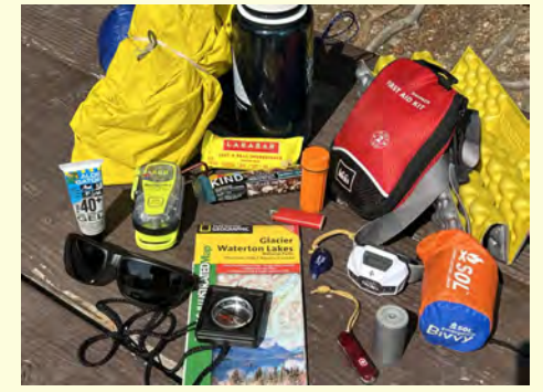
The 10 essentials.

We will meet at the AMC/CMC building in Golden on Wednesday July 24 from 6:30 to 9:00 pm. Add to your hiking confidence by learning how not to get lost, and how to survive if you do. Review basic trail navigation, mountain weather, lightning, the ten essentials, trip safety planning, clothing, surviving forest fires, dangerous animal encounters, and more.