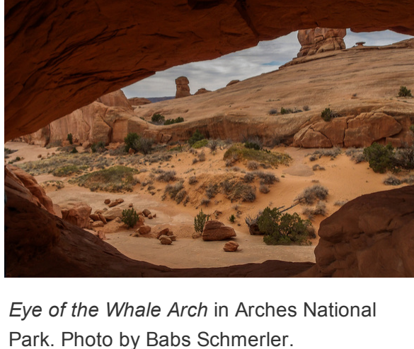
Eye of the Whale Arch in Arches National Park.

See below on how to submit your favorite photo for the newsletter!