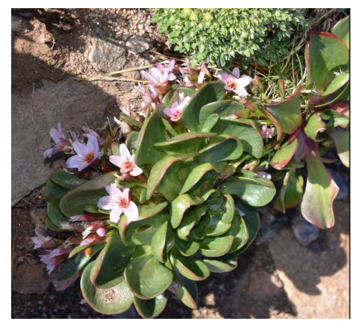
Alpine Spring Beauty