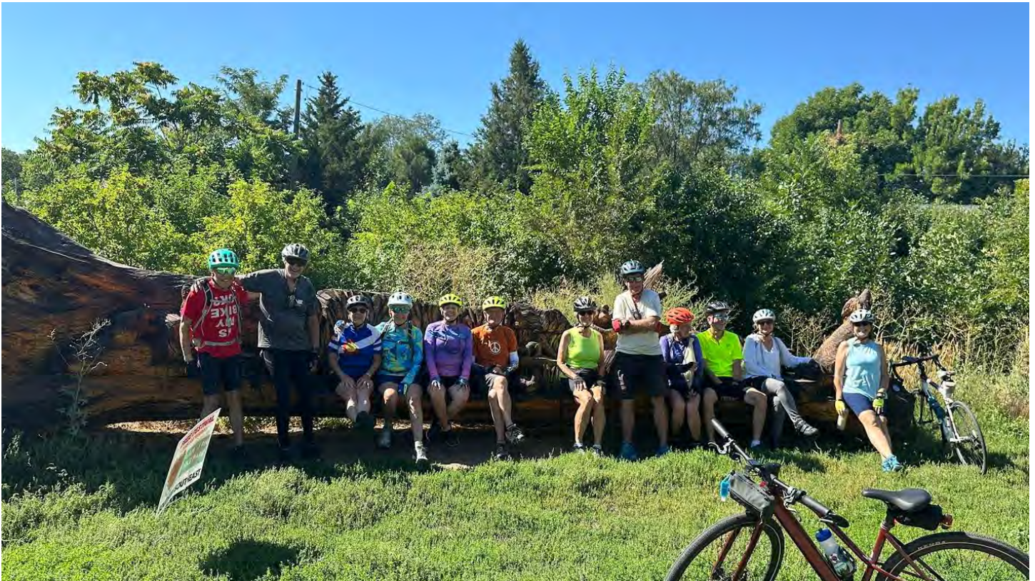
Beautiful Ride on the Highline Canal

Sept. 27: Aurora Municipal Center Highline Canal to the end.