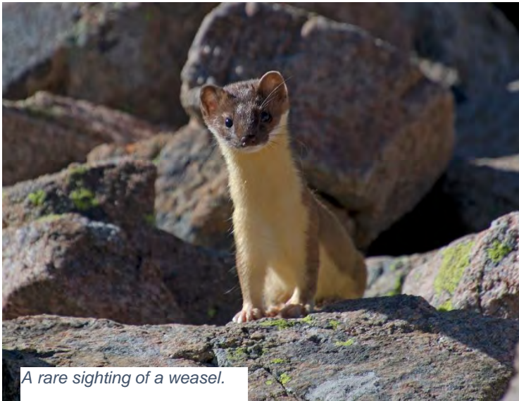
A rare sighting of a weasel.