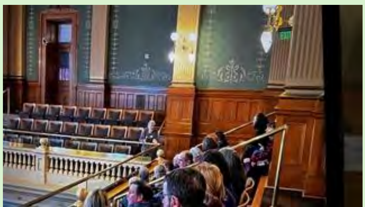
Ginny pointing out the interesting architectural features of the building