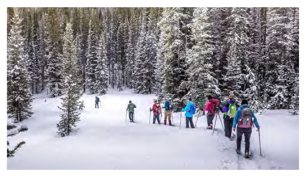
Another North Tenmile Creek Photo. Ahhh, the beauty of our mountains in winter!!