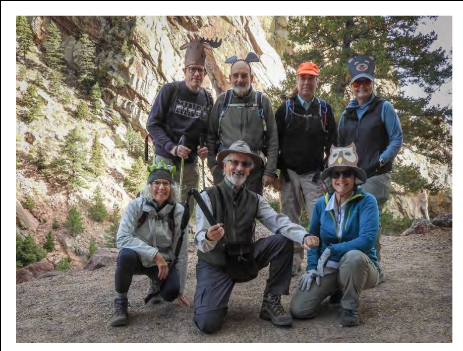
Indiana Jones and assorted critters found hiking on the El Dorado