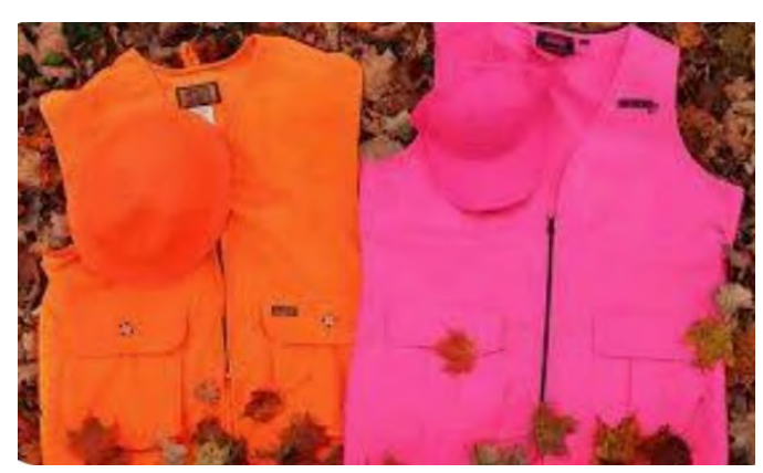
BE VISIBLE - WEAR YOUR ORANGE OR VIVID PINK

We've again been lulled into an endless summer here in the metro area but snow is coming to the mountains. It's time to keep your microspikes and snow baskets for your poles handy. You may need to be packing extra layers and hot drinks soon.