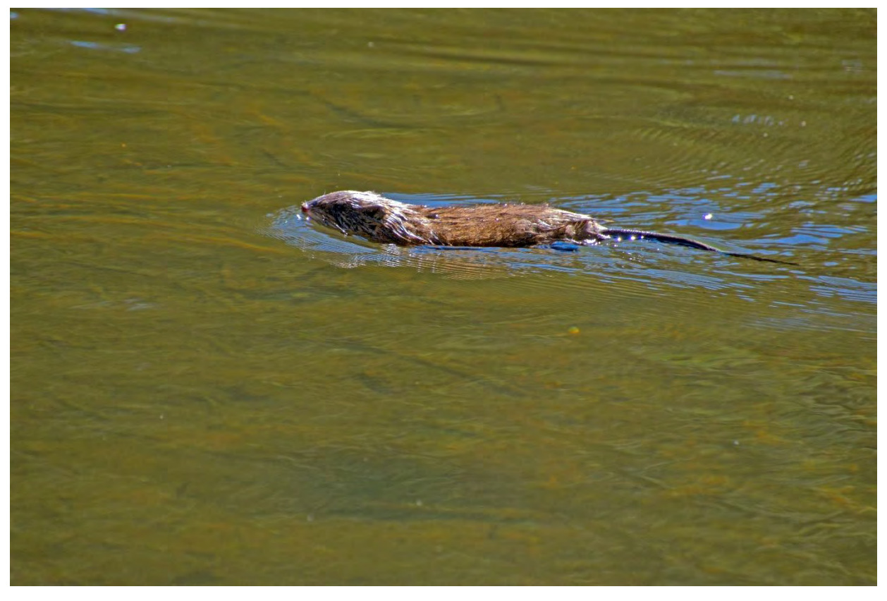
The lucky folks on the Three Mile Hike spied a beaver.