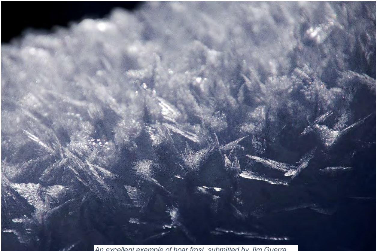
An excellent example of hoar frost