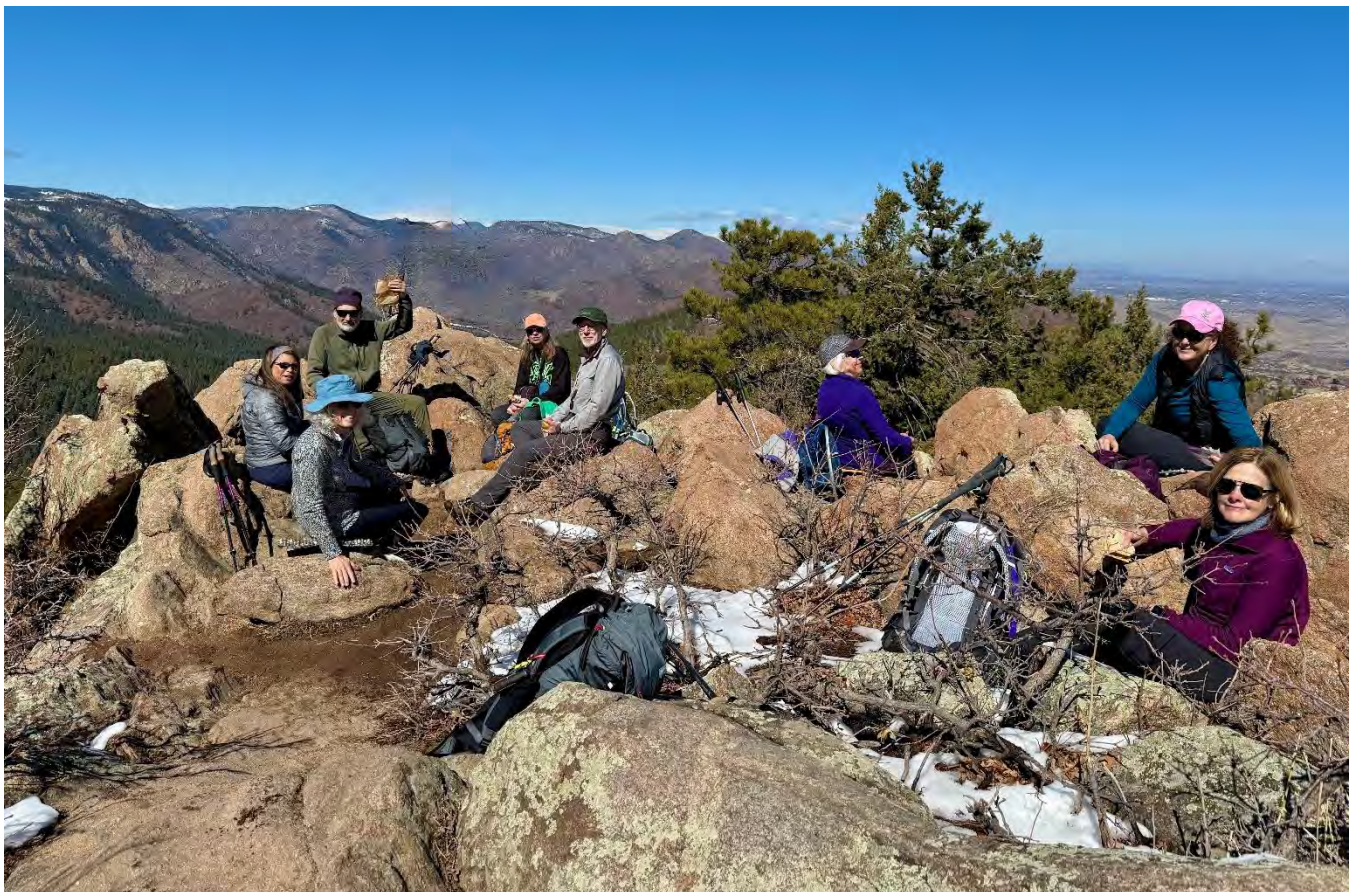
Lunch on Carpenter Peak