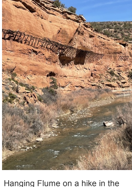
Hanging Flume on a hike in the West End trails.

See below on how to submit your favorite photo for the newsletter!