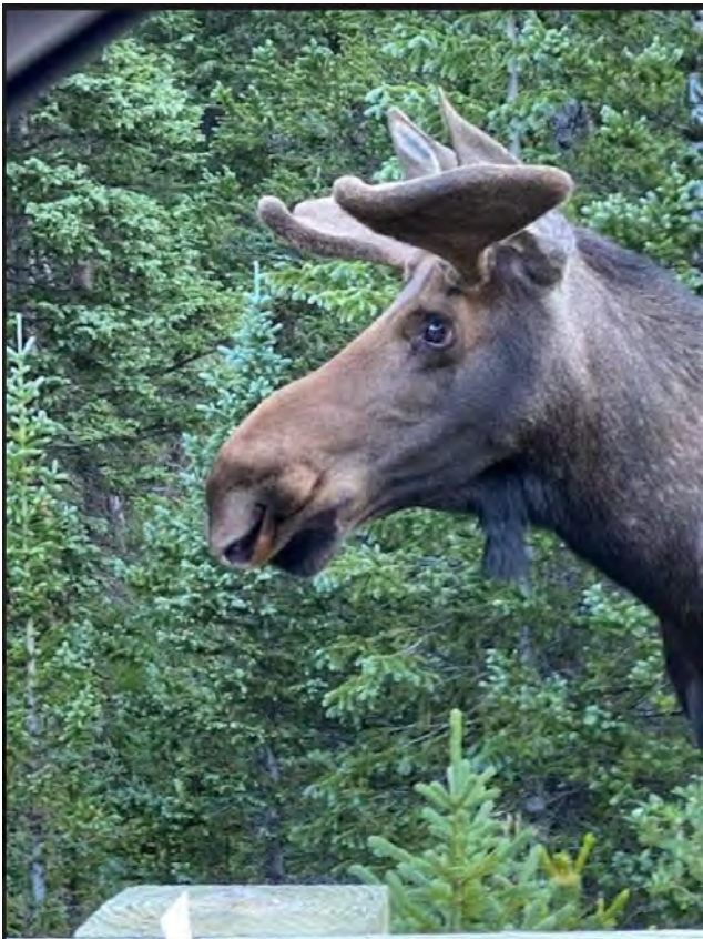
Now that's a close up! Taken from a car window. Geneva Mtn hike led by Jeanne Eiss