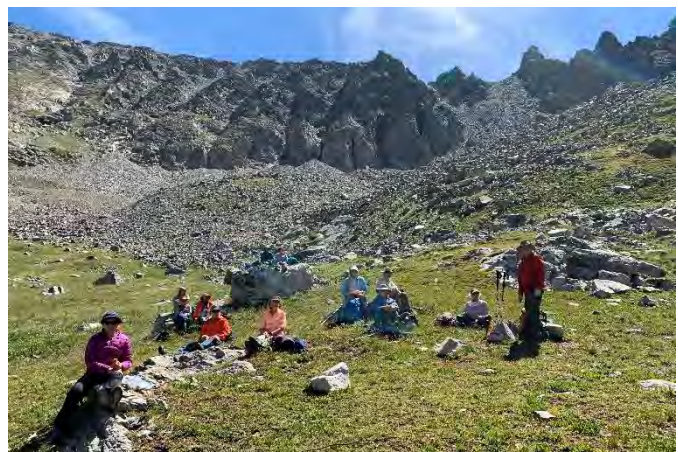
Lunch at Mayflower Gulch 1