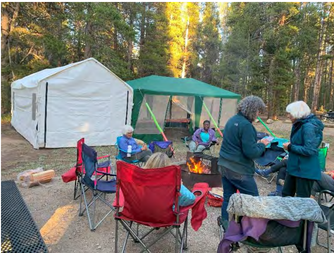
Monday Night campfire 1