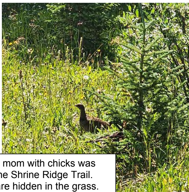
A Ptarmigan mom with chicks was spotted on the Shrine Ridge Trail. The chicks are hidden in the grass.