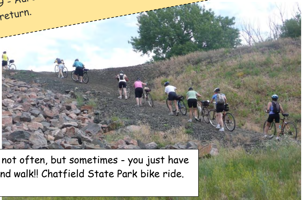
Sometimes - not often, but sometimes - you just have to get off and walk!! Chatfield State Park bike ride.