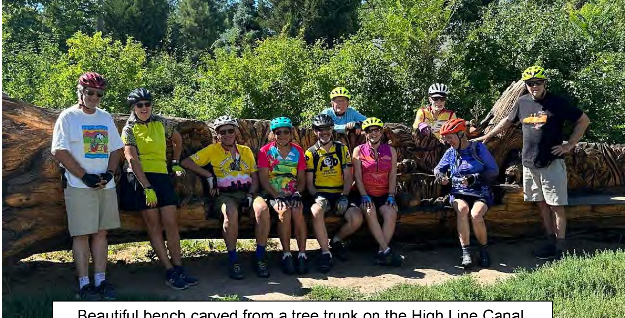
Beautiful bench carved from a tree trunk on the High Line Canal.

RMOTHG Cyclists are having a wonderful summer of bike rides with an average of over 10 participants each week. The trips are Friday mornings and sometimes on other days in the Denver and greater Denver areas, with two styles of riding called the Hares and the Terrapins. Hares ride approximately 20 to 30 miles at a speed of 10 to 12 mph. Terrapins ride at a more leisurely pace of less than 10 mph and go approximately 10 to 15 miles with a few more stops than the Hares. The outings are mostly on paved bike trails and we try to keep the rides fairly flat, but we do encounter some hills and gravel paths.