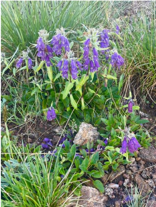
Whipple's Penstemon, Whipple's Beardtongue