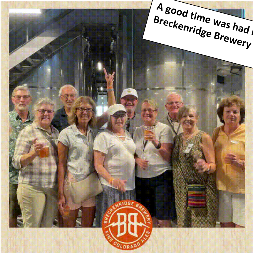
A good time was had by all at the Breckenridge Brewery tour and lunch.