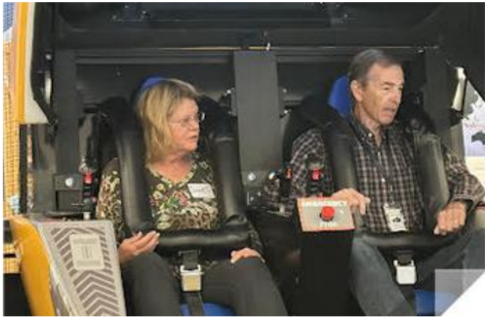
Wings Over The Rockies Social Event