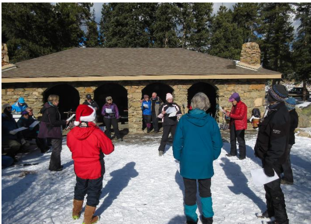
Photo from the 2022 carolina snowshoe.