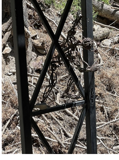
The troll on the Oak Creek bridge of the Perimeter Trail in Ouray.

See below on how to submit your favorite photo for the newsletter!